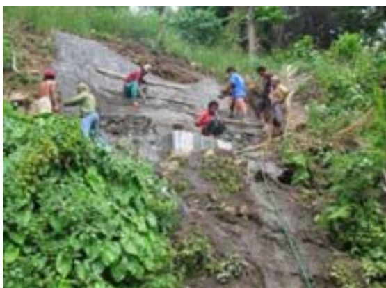
Manikaji Water Spring projects

are progressing well, with both primary and Junior High School students averaging 80% correct on their semester exams. The program of giving each child a daily nutritious meal, glass of milk and multi-vitamin has contributed to this. We are also pleased to inform you that due to the success of the safe water awareness and education program the child mortality for 2006 has been reduced from 50% in 2003 to ZERO. The organic gardens and worm compost program are still in the experiential stages. Over twenty goats are providing fresh milk for the students.