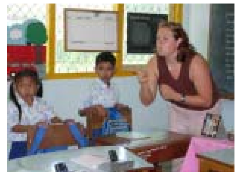
Teaching the sound "u" "Now you say it".

She used pictures of everyday objects/animals to illustrate the sounds as well as colored blocks. Again those with partial hearing (two were wearing hearing aids sponsored by