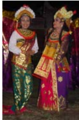
Two performers in the Luh Luwih encourage women to get regular check ups.

See www.ykip.org/northbali.asp for photographs and details.